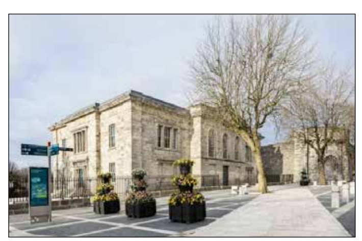
Kilmainham Gaol Courthouse

The Irish Architecture Foundation in 2016 marked the 11th OPEN HOUSE DUBLIN, the longest-running Irish event, from 14th to 16th Oct. Open House Dublin's 2016 theme was The Presence of the Past. In the commemorative year of revolution leading to Irish independence, Open House Dublin revealed how the development of our cityscape conveys the changing social, political and cultural priorities of Dublin, throughout history and into the future. Highlights and first time buildings included the Magazine Fort at Phoenix Park, Kilmainham Courthouse, and GPO.