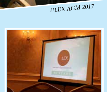
30th AGM at Imperial Hotel