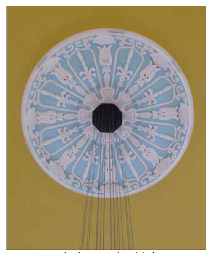
Restored Ceiling Rose and new light fitting.

Sensitive restoration work has been carried out on the courthouse, included sourcing missing stone pieces from a County Clare stone quarry nearest to original for restoration, The team, Architect: OPW Architects & Mahoney Architecture. Client: OPW. Engineers: Malachy Walsh & Partners. Quantity Surveyors: Leonard & Williams QS. Dublin City Council's City Architects' office works on issues affecting the city's buildings and public spaces and about designing to improve them.