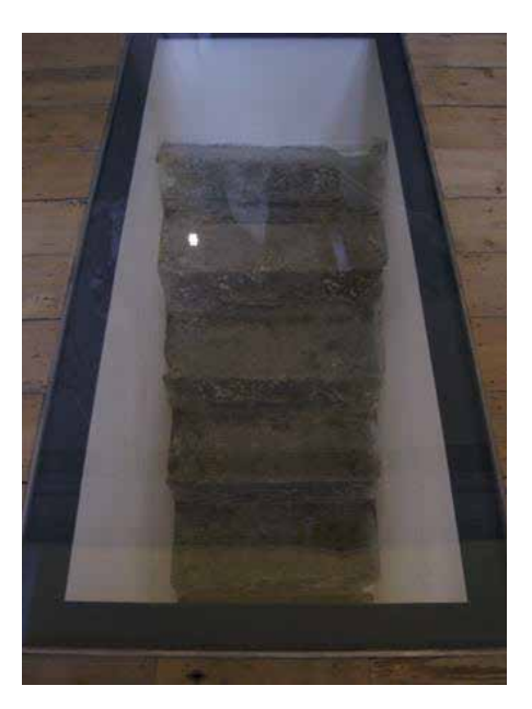
Recently uncovered flight of granite steps leading to holding cells in the basement.

The newly restored Courthouse and upstairs cafe in these amazing surroundings have open access to the public and recommended visiting to be of interest to legal eagles!