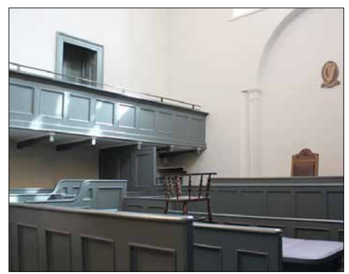
Kilmainham Gaol Courthouse.

This included the renovation of the adjacent 19th Century courthouse. This building was adapted to provide ancillary curatorial, exhibition, research, and welfare facilities. This is to deal with the expected increase in visitors to this historic location. In addition, the recently reopened Irish Museum of Modern Art, located in the grounds of the Royal Hospital, Kilmainham, attracts over 400,000 visitors each year from Ireland and abroad.